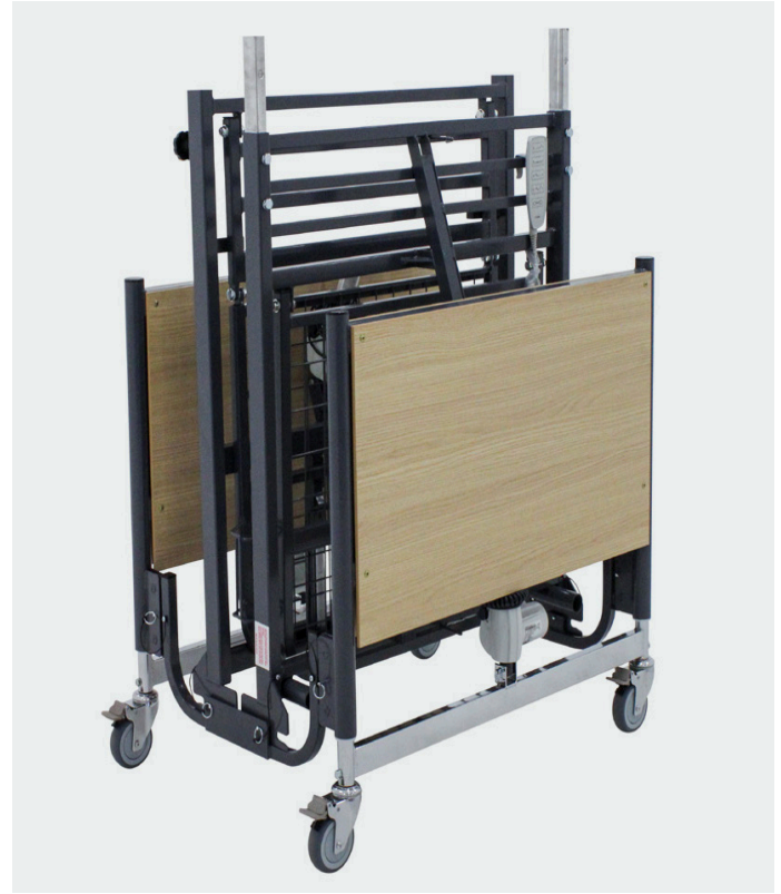
Transportable Design for easy transport & Storage