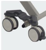
100mm Breaking Castors