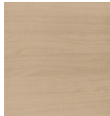
Oak Head & Footboards